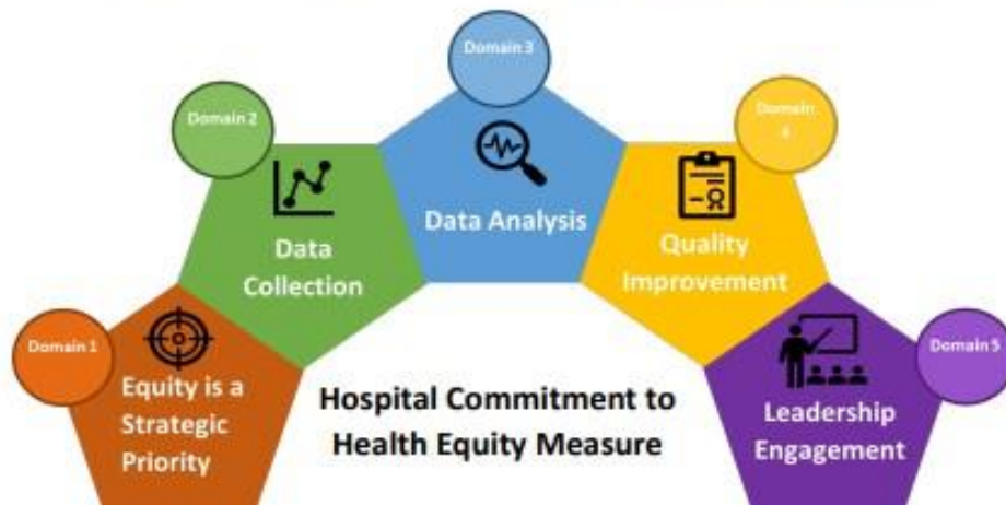
Figure 1: Hospital Commitment to Health Equity Measure Attestation Domains

Hospitals will attest to the Hospital Commitment to Health Equity measure via the Hospital Quality Reporting (HQR) system.