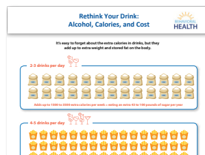
Download Rethink Your Drink flyer