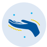
Parkinsonism A neurological disorder resembling Parkinson's disease 5