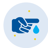
Destabilized Blood Sugar