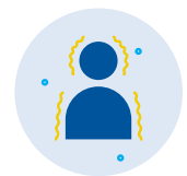
Tardive Dyskinesia A neurological disorder characterized by involuntary uncontrollable movements especially of the mouth, tongue, trunk, and limbs 4