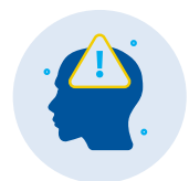
Loss of Facial Expressions