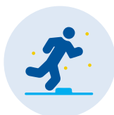
Falls or Unsteady Gait